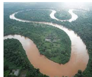
Tana River Longest River