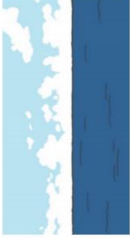
sea or ocean