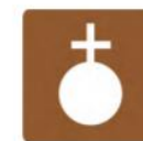
place of worship